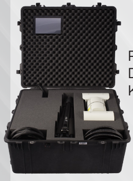
Rapid Deployment Kit